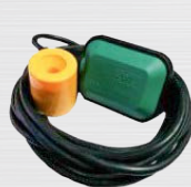
Tank full switch inc 20m cable $165+GST