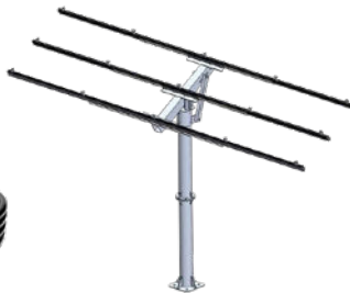
Heavy Duty Cyclone Rated Pole Mount Frame