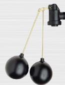
Double acting float valve For use with Pressure Switch - $275+GST