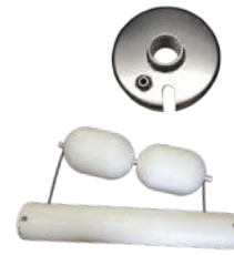
Bore Cap or Dam Float