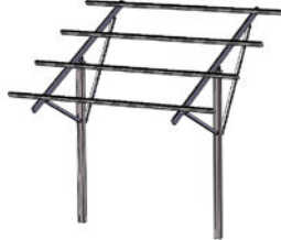
Heavy Duty Cyclone Rated Pole Mount Frame