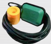
Tank full switch inc 20m cable $165+GST