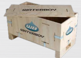
Shipping Dimensions 1x Crate 440 x 60 x 65cm @ 280kg 1x Pallet 200 x 115 x 45cm @ 190kg