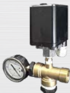
Pressure Switch 12 bar inc gauge & fittings $275+GST