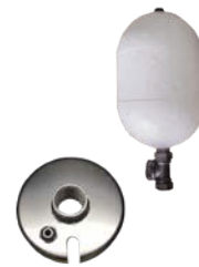
Bore Cap or Dam Float