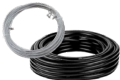
35m of Power Cable low water probe & safety cabling