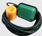
Tank full switch inc 20m cable $165+GST