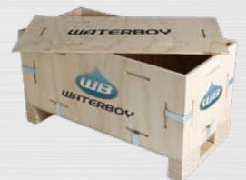
Shipping Dimensions 1x Crate 175 x 55 x 65cm @ 125kg