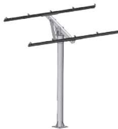
Heavy Duty Cyclone Rated Pole Mount Frame