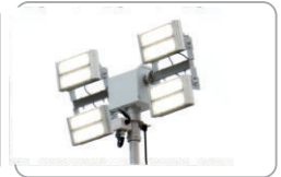
360 DEGREE ROTATION